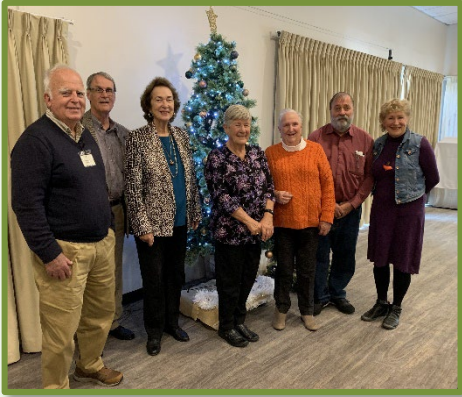
Members at our luncheon at Summerland House Farm