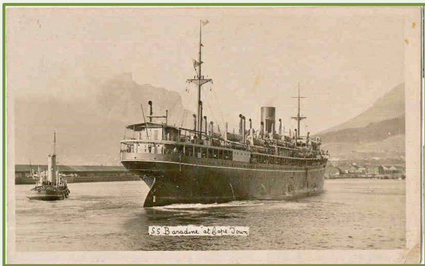
Built in Belfast, 1920.