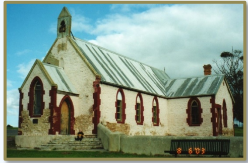
The Point McLeay mission church in 2003