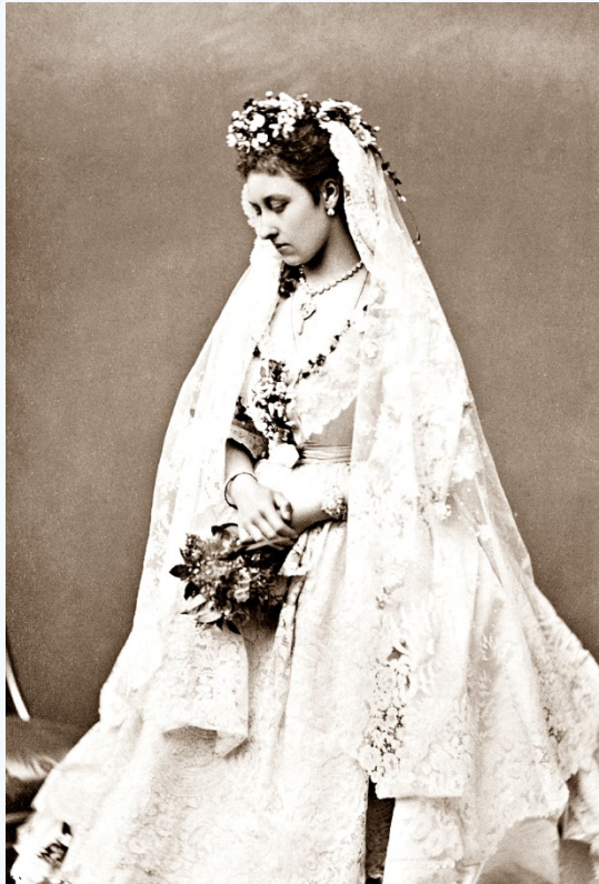
The Wedding of Princess Louise in 1871. Windsor Castle.

Journal of the Richmond-Tweed Family History Society Inc. Ballina NSW Australia