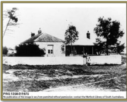
The Taplin house at Point McLeay mission.