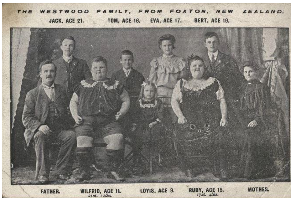
The Giant Children of Foxton – see article on page 10